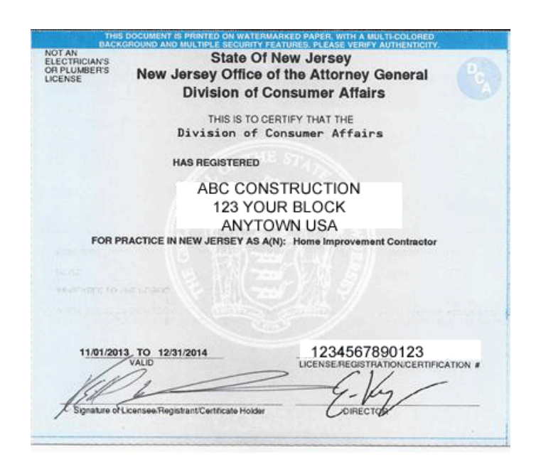
Sample Contractor Trade License

All bidders are to submit with their proposal all current, valid contractor or trade licenses as issued by the New Jersey Division of Consumer Affairs, for any trade or specialty area the contractor seeks to perform work for this particular proposal.